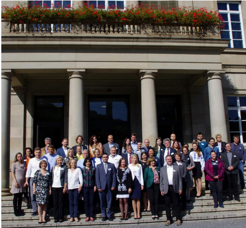
Participants of the Days of Ukraine in Baden-Württemberg. Tübingen, 19 September 2019.

important role of complementary expertise in developing strong and lasting partnerships. Moreover, the program included successful examples of joint study programmes, student testimonials, a poster session and a panel discussion on R&D in private sector.