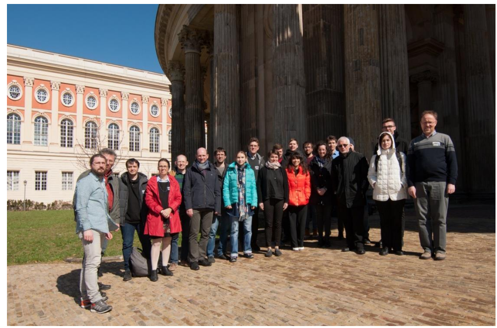
Participants of the workshop, Potsdam, April 2019.

Research Group Linkage grant "<u>Singular diffusions: analytic and stochastic approaches</u> (2018-2021)" between the Institute of Mathematics of University Potsdam and the Institute of mathematics (NASU), funded by the Alexander von Humboldt foundation. This alumni program supports long-term research collaborations between academics in Germany and abroad.